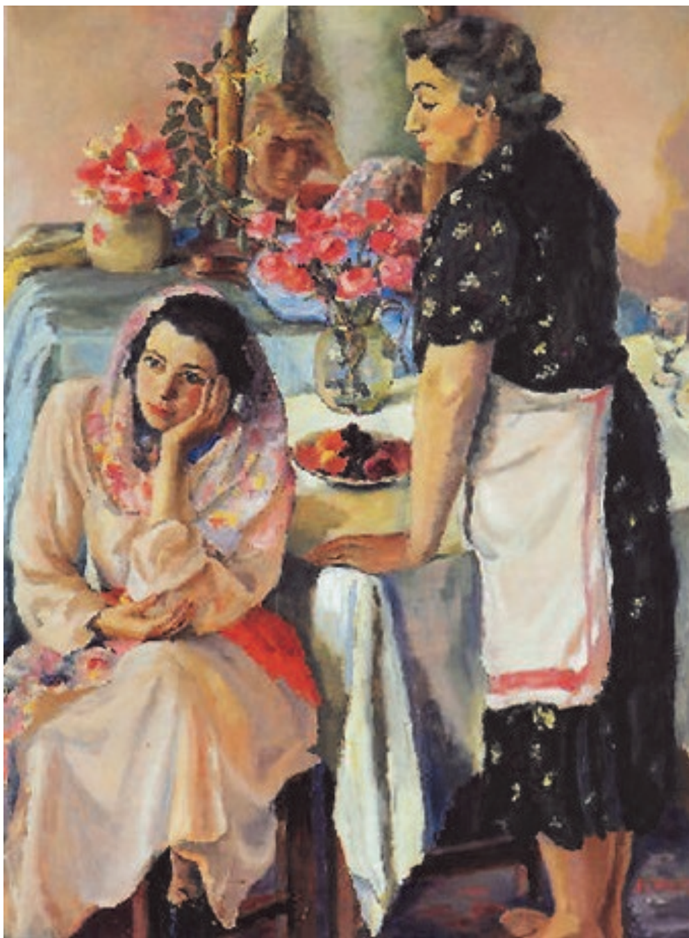
Mary and Martha