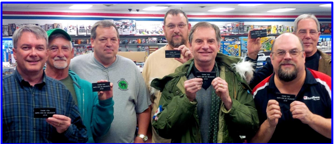
NACM "Memorial Paver Program" Chapter Donation Challenge

Editor, “The Wildcat”, AMPS Central SC “Wildcats”