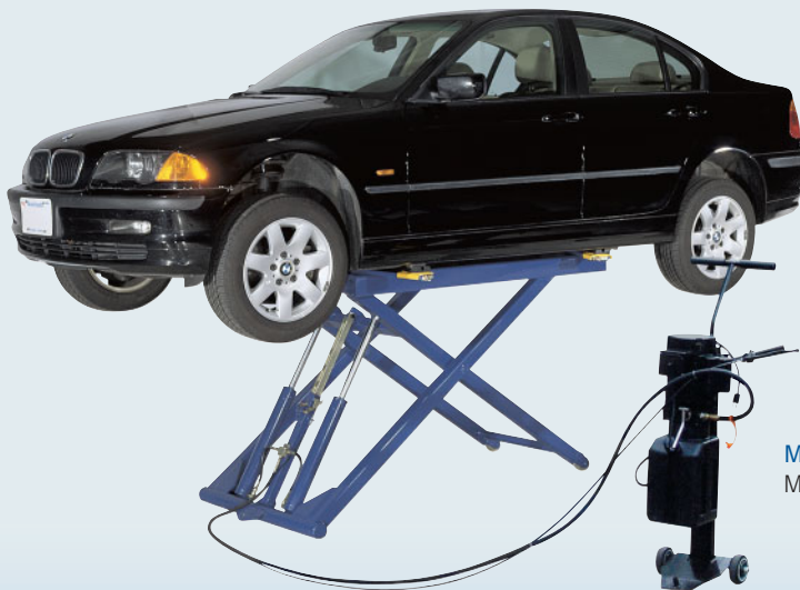
MR6K-48 Mid-rise lift

Mid-rise models lift cars, vans and light-duty trucks. They are ideal for tire, wheel and brake related repairs, collision repair work and new car preparation.