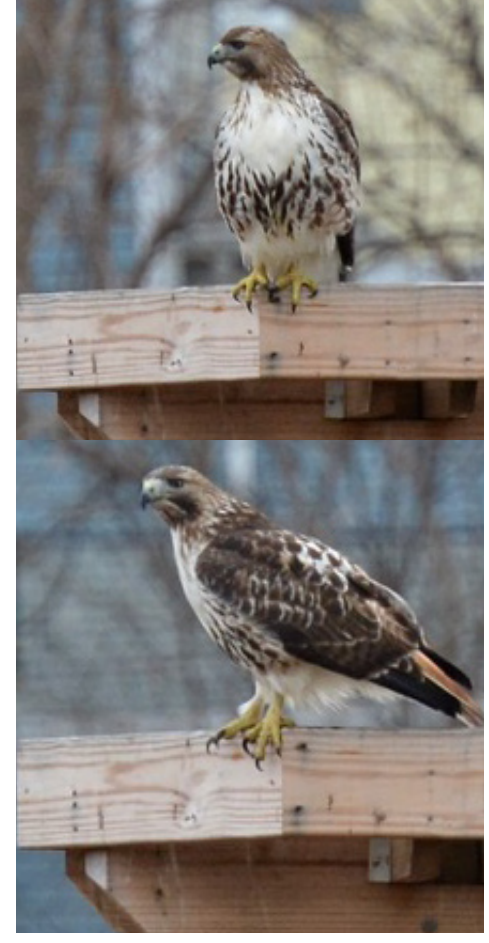
A very large red tailed hawk visiting the Platform in our "third" marsh... scouting for lunch. Free rodent control!

I wish you a healthy, happy and prosperous 2016. Tackev