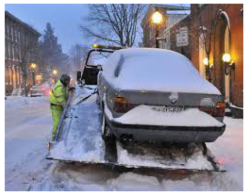
Don't let this be your car this winter