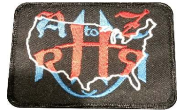
U.S. Cities A to Z