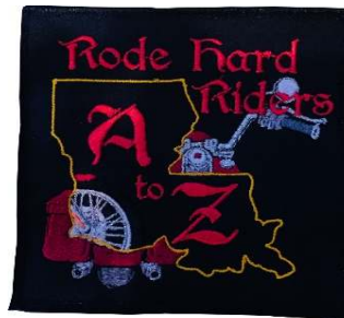
LA Cities A to Z