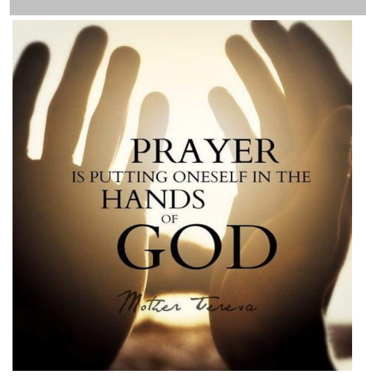
When You Need Greater Faith

Key Scripture: "Above all, taking the shield of faith, wherewith ye shall be able to quench all the fiery darts of the wicked" Ephesians 6:16.