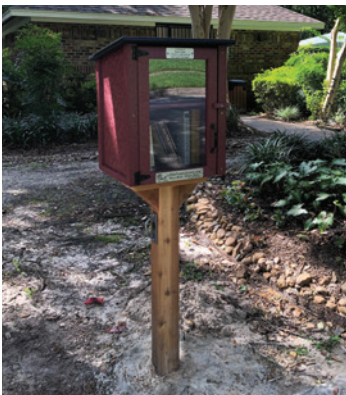
"Free Little Library"