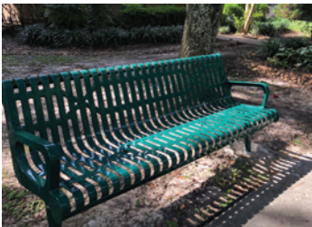
"Library and Bench at Woodwind Lakes"