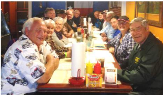
OTC Members enjoying lunch at Lonestar BBQ

Our May meeting was at the Evergreen Air Museum. The weather was inhospitable (to say the least). We had a large showing of members, but with the deluge of rain, everyone arrived in automobiles. It was either take the car, or sign up for a place on the ark. Several members braved the rain to scout out the grounds for the upcoming rally. Our meeting was held at a large table off to the side of the museum's restaurant and gift shop. When the meeting adjourned, members made their way to Lonestar BBQ in Dayton. Lonestar is catering one of the dinners for our July rally. The staff were friendly and efficient, as usual. The BBQ owners came by to suitably and good-naturedly harass us. One OTC member had a rack of ribs and used their knife and fork to eat them. This became a question of etiquette – "pick them up with your hands and dig in" was the consensus directive. The meal was very enjoyable and the portions overly-ample. Many of us waddled out with a doggie bag, but I doubt if Fido saw any Lonestar leftovers.