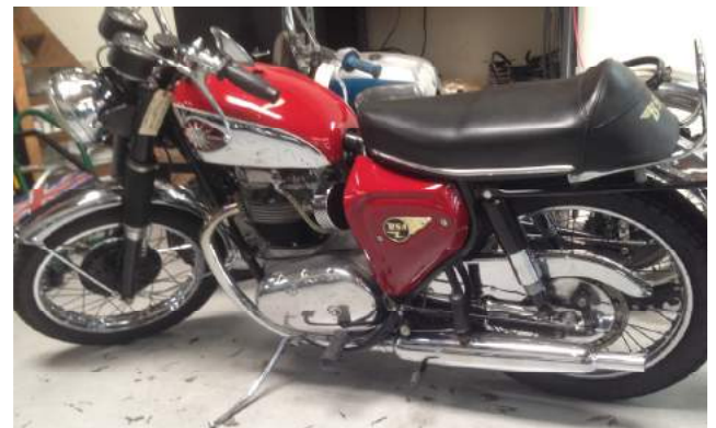
1967 BSA A65