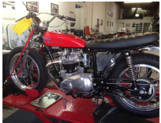
1969 TCM Triumph TT Special