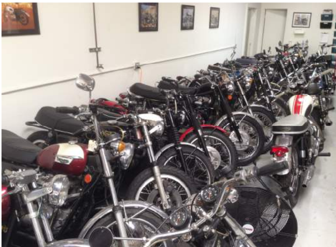
Line up of bikes at Triumph Classic Motorcycles in Costa Mesa, CA