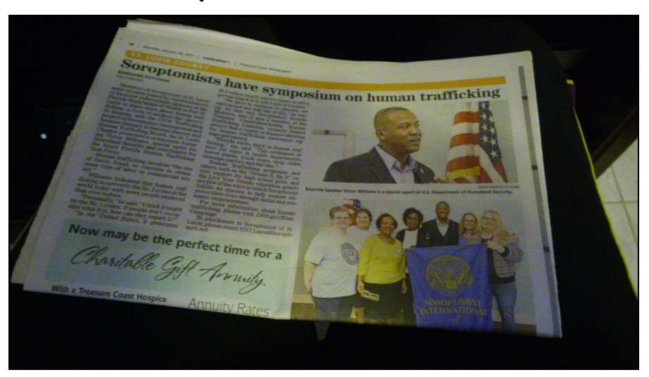
From SI St. Lucie—good publicity for their human trafficking symposium!

SI Boca Raton/Deerfield Beach got some welldeserved publicity for their aid to the community.