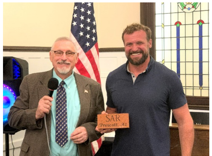
Thank you for your service.