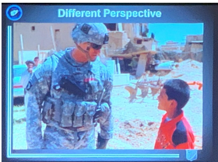
Serving in Afghanistan he met a real helper.