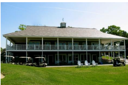
Lake St. Catherine Country Club