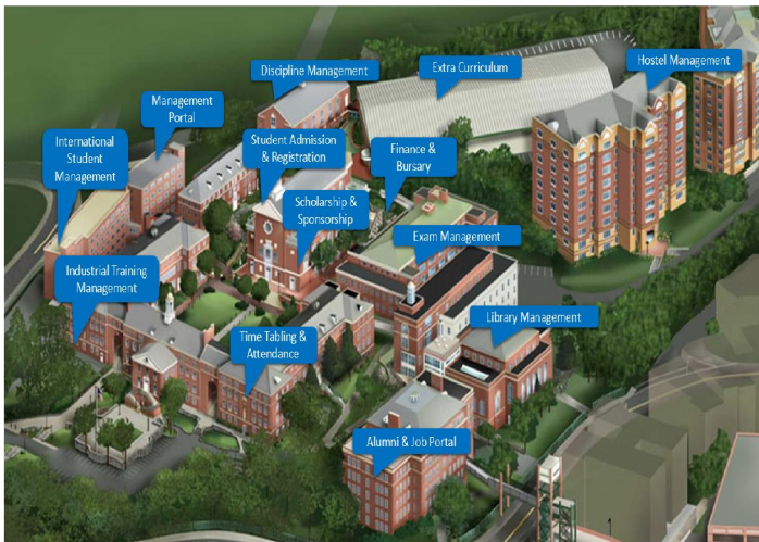
GoMyCampus Solution Overview

GoMyCampus is a complete hosted campus management. GoMyCampus developed by industry expert which proven with various successful deployment for the past years. It is a more enhanced complete solution with well-integration between various modules. This solution is built on the most reliable database technology and HTML5 which is mobile and tablet compatible.