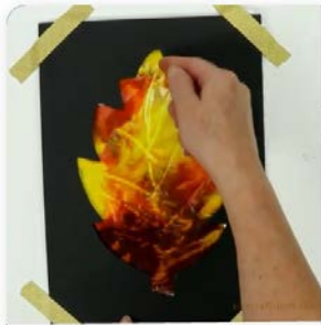
Sensory Leaf Painting