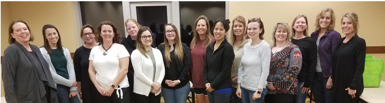
2018-2019 Board Members

Positions highlighted in yellow denote open positions