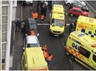
Gunman screaming 'Allahu'