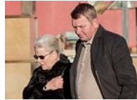
Heartbroken family hear how