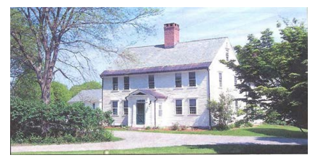
The Bullard Memorial Farm 1777