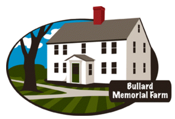
7 Bullard Lane Holliston, MA 01746 Since 1658