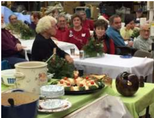
Attendees at South Shore Woodturners Holiday party