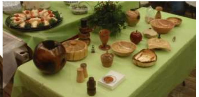
Two views of the Gift Grab items