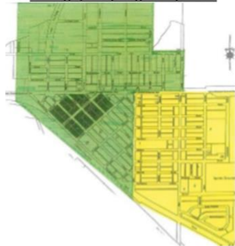
Garbage / Recycling Pickup Areas

Please have bins at least 1.5 feet apart at curbside