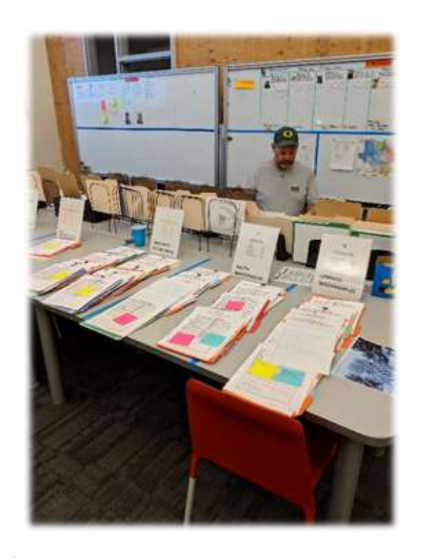
Updating process and software