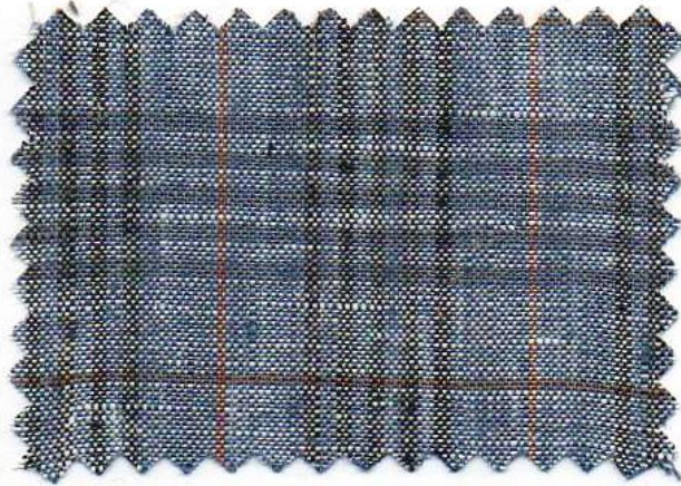
1033 Grey Plaid