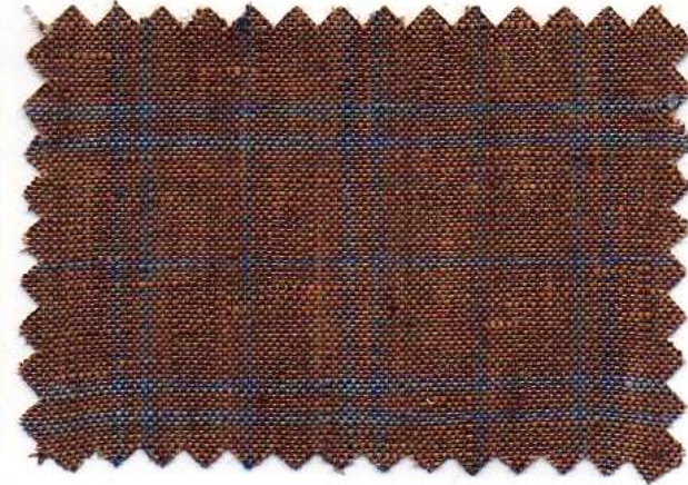
1034 Rust Plaid