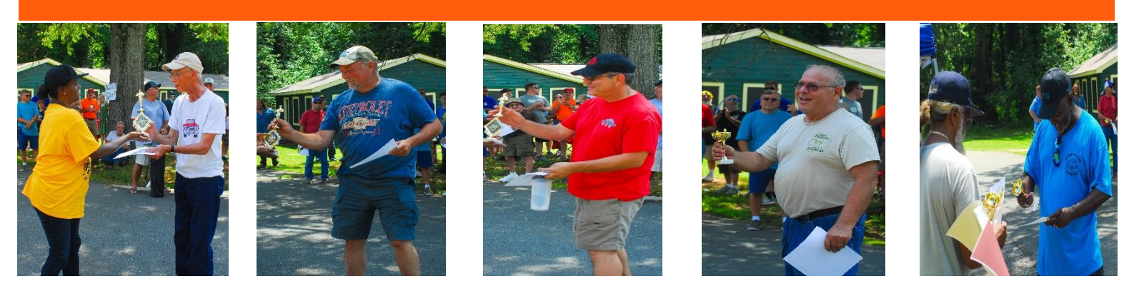
Winners took home trophies in a competitive turnout of more than 50 participants.