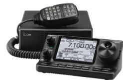
IC-7100 All Mode Transceiver