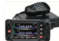
FTM-400XD 2M/440 Mobile