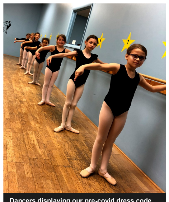
Dancers displaying our pre-covid dress code

All jazz, tap, lyrical, contemporary, hip hop, and musical theater classes require a black leotard and black leggings. Jazz shoes are required for jazz, hip hop, and musical theater classes (tan by recital). Foot undies are required for lyrical and contemporary; senior dancers may wear dance socks (tan by recital). Tap and ballet/tap classes require black tap shoes. Dancers may wear a Twinkle Toes t-shirt over their leotard in these styles. Hair must be pulled back.