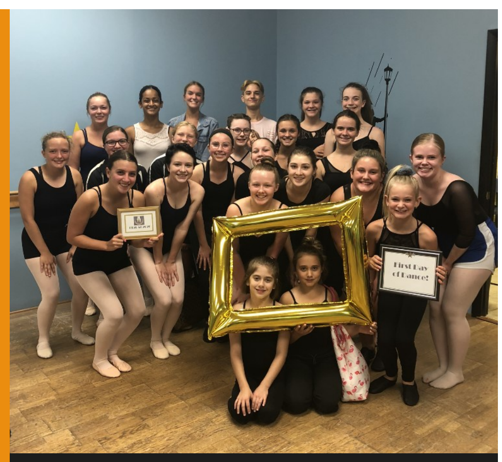
First day of dance, fall 2019

Bank draft to: Twinkle Toes LLC 2401 Seaboard Road Ste. 101 Virginia Beach, VA 23456