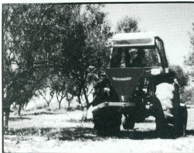
Optional Side Discharge