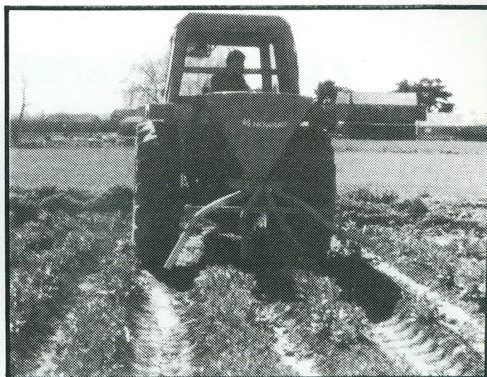
Optional Inter-Row Equipment