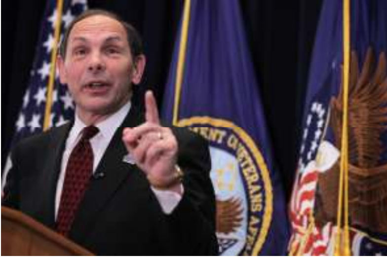
Secretary of Veterans Affairs Robert McDonald speaks during a news conference Sept. 8, 2014, in Washington, D.C.

Veterans and some VA doctors say that the new “choice card” program, meant to reduce long patient wait times, is confusing and causing more stress. The choice card issued by the embattled Department of Veterans Affairs was meant to end long wait times for veterans after last summer’s scandal revealed that those who fought for their country were dying while waiting for care. The card gives veterans who have been waiting more than 30 days for appointments or who live more than 40 miles from a VA facility the chance to see a private doctor.