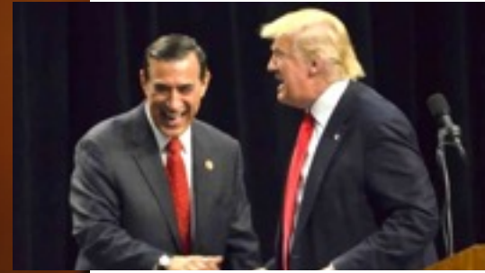
Darrell Issa endorses Donald Trump