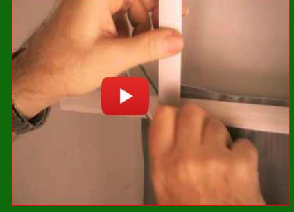
Ask For A Free Quote