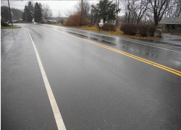
Waterloo Road Cross Section