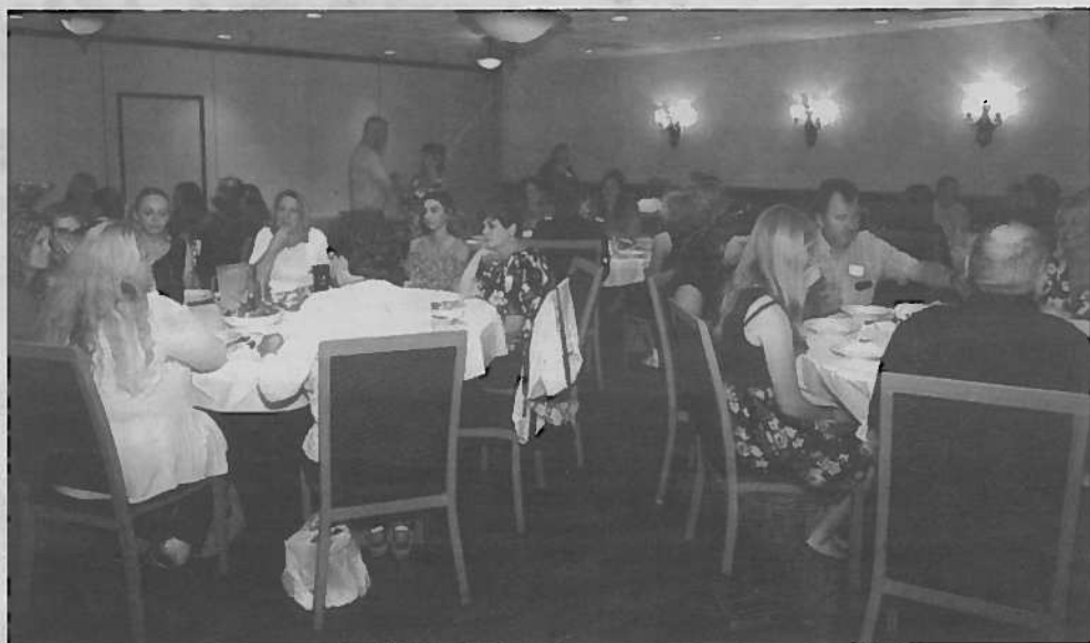
The organization's annual scholarship benefits graduating seniors and women in the Lincoln-Way area.

entering the next chapter of their lives for decades.