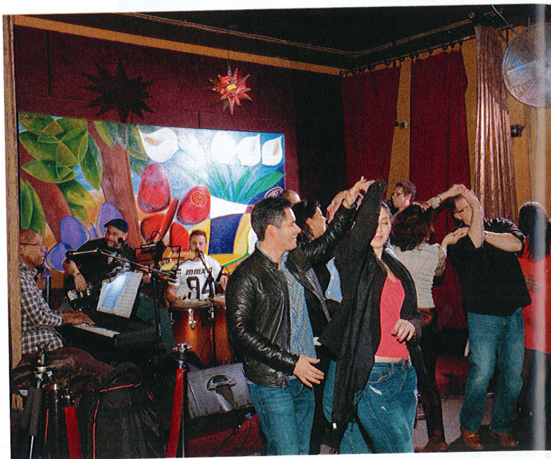
Eclipse di Luna has a mix of dance music planned for Cinco de Mayo starting with a DJ spinning Latin tunes. Live music includes a mariachi band, salsa and meringue.

11585 Jones Bridge Road, Johns Creek. 770-772-1077. adobotequilabar.com ■