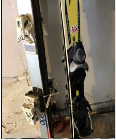
Please contact Sigrid Noack for details.