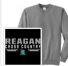
$17.25 CLASSIC CREWNECK SWEATSHIRT Available in 1 other color.