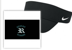
$21.00 Nike Dry Visor