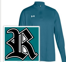
$37.25 UA Locker 1/4 Zip Available in 2 other colors.