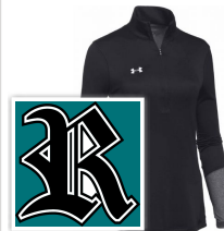
$37.25 UA Women's Locker 1/2 Zip Available in 1 other color.