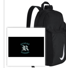
$44.50 Nike Academy Team Backpack