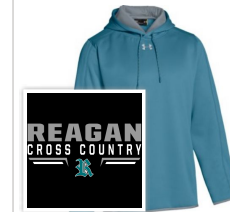
$50.00 UA Double Threat Armour Fleece Hoody Available in 1 other color.