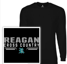
$18.50 BSN SPORTS PHENOM LS T- SHIRT Available in 1 other color.