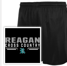
$21.25 Women's Track Short- black