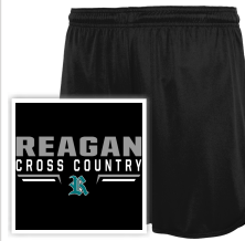
$21.25 Men's Track Short- black