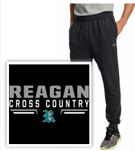
$25.50 POWERBLEND JOGGER Available in 1 other color.