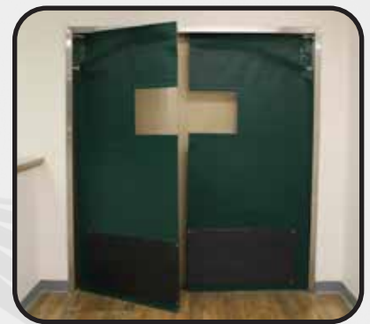
Shown w/ optional 18" impact plates