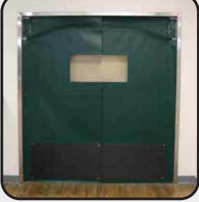
Shown in Forest Green