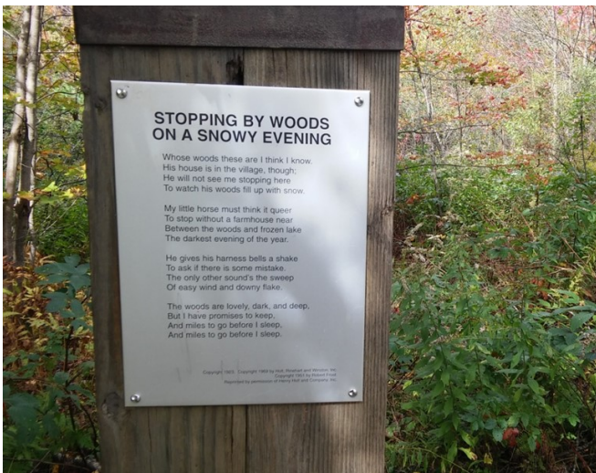
along the Robert Frost Trail in Vermont.