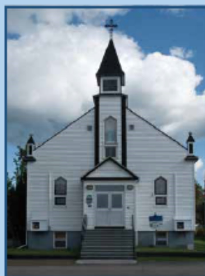
Our Lady of Mercy Pointe-du-Chêne