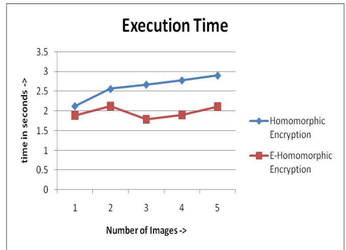
Figure 3: Execution Time

Figure 3 depicts a comparison between presented and previous algorithm implementation time. The existing algorithm is of homomorphic encoding type while the projected algorithm is a modified version of homomorphic encoding system.