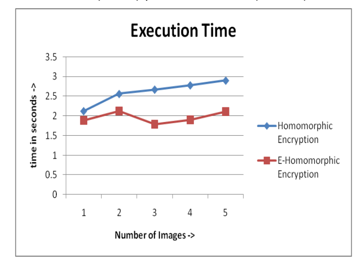
Figure 3: Execution Time

Figure 3 depicts a comparison between presented and previous algorithm implementation time. The existing algorithm is of homomorphic encoding type while the projected algorithm is a modified version of homomorphic encoding system.