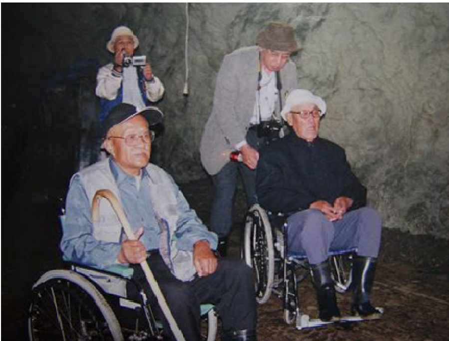
Aided by Japanese supporters, forced labor survivors in wheelchairs return to the Gunma Prefecture mine where they toiled without pay more than sixty years ago.

The three main programs for forced labor in Japan involved Allied prisoners of war, Koreans and Chinese. Millions of Asians are thought to have worked against their will for the empire outside of Japan, but the historical record remains underdeveloped and is not considered here.