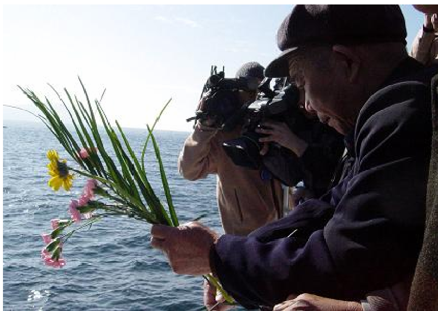
A shipboard memorial ceremony in Nagasaki Bay, for fellow Chinese forced laborers who never returned from Mitsubishi's Hashima coalmine.

Although municipalities and temples have generally cooperated by providing conscript name lists, cremation records and even human remains for DNA testing, many companies (including a former Fukuoka mining concern belonging to the family of Foreign Minister Aso) continue to fob off the persistent requests from the South Korean truth commission. Having been a major user of both Chinese and Korean forced labor, Mitsubishi in this CFL case may be seeking to contain any spillover effect from the KFL inquiry. A successful outcome for Mitsubishi's legal gambit could set an unfortunate standard for other companies facing forced labor claims.