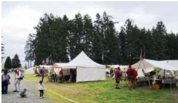
Visiting Trader's Row at the Rendezvous

"It seems like forever since we left the trading post in St. Louis, but each day brings a new adventure. Signing on with Captain Henry's brigade was a great idea. I never thought I'd see a buffalo, but that day on the plains we shot three of 'em to smoke for our long journey ahead. In the distance we can see the Rockies and it won't be long now before we find some good streams full of beaver. Our traps will be full in no time."