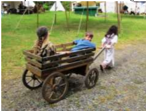
Transportation was no problem for these kids