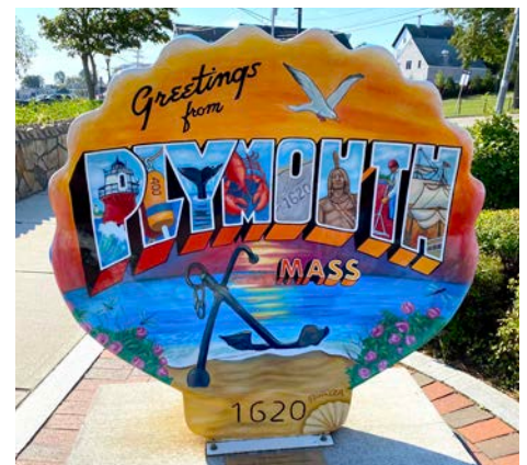
Plymouth hosted the 2021 GBOA Meeting. The next meeting will be held Sept 5 -12, 2022, in Bloomington, Minnesota.