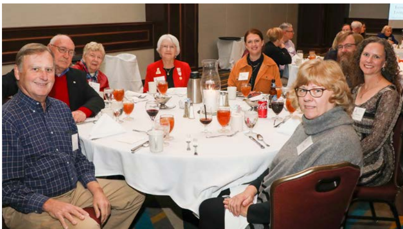
Long-time members share a table with new members at the luncheon.