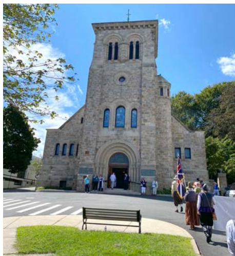
The Mayflower Society is instrumental in restoring the Meetinghouse.