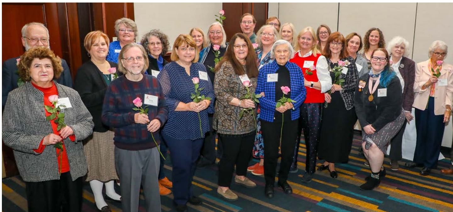
The Illinois Society welcomed 22 new members. Each received a pink rose and had a candle lit to honor their ancestors.