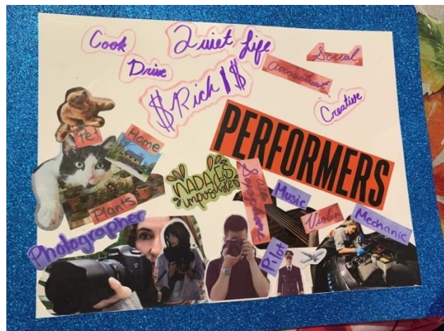
Two more Dream Collages above.

to buy them. Thank you! The girls did a fabulous job illustrating their career goals and values for their futures and were eager to explain them to the group.