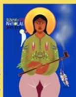
Servant of God NICHOLAS BLACK ELK