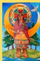
Saint KATERI TEKAKWITHA