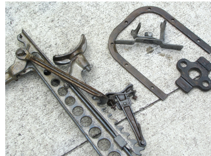
These parts that were soaked in a molasses solution were washed and are now free of all rust.