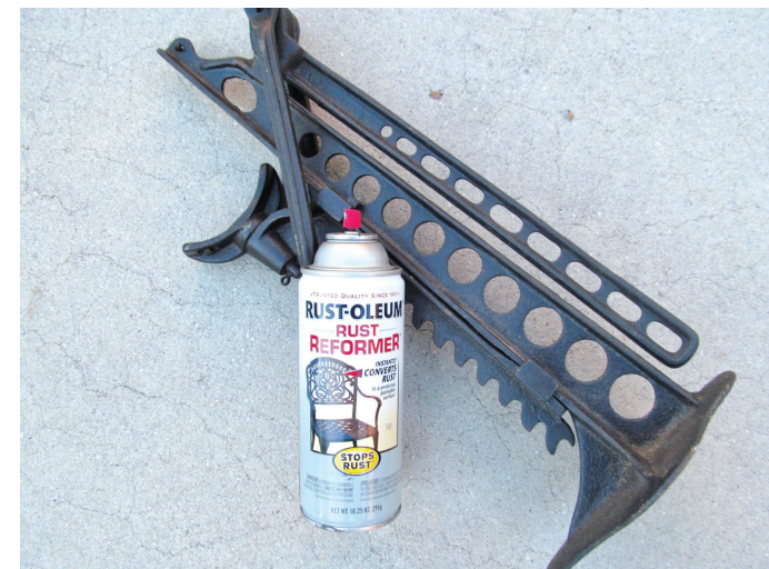
This jack stand is preserved with a spray rust primer with a black finish.