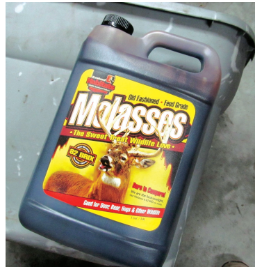
A gallon jug of feed grade molasses can be found at farm and feed stores for about $10.