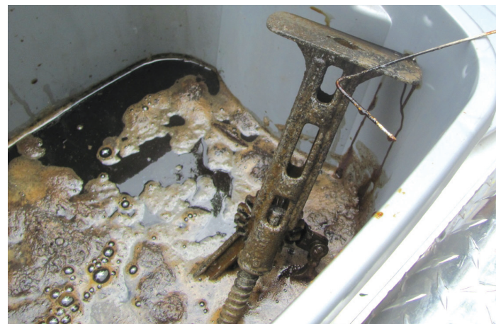
Be sure to fully submerge the part(s) in the molasses solution for the most effective rust removal action.

Immediately after washing off the molasses mixture, the bare metal part will begin to rust again. Apply a preservative, like primer or paint, as soon as possible after fully drying the part.