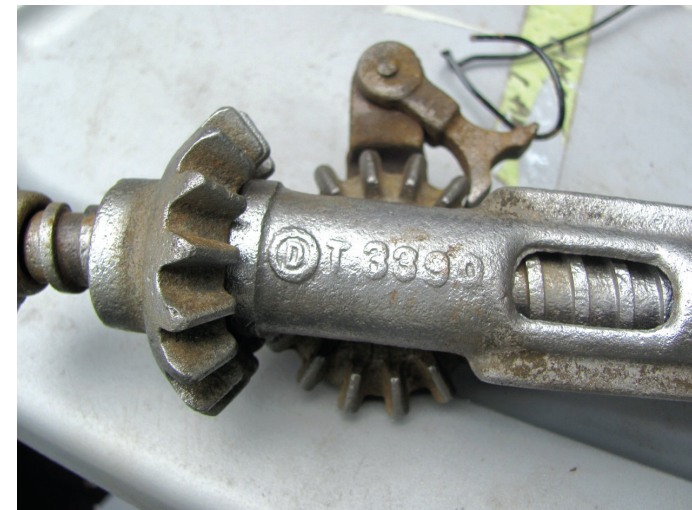
The effective rust removal solution revealed details not able to be seen previously, and restored the jack to operating condition.

A black residue will form on the surface of the part(s) as rust dissolves.