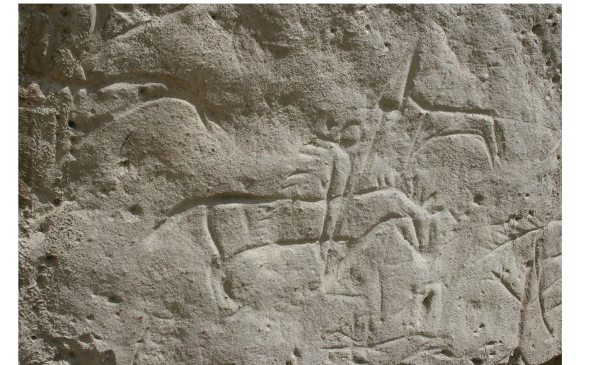
Top: Pine Canyon petroglyph panel depicting a combat scene. Illustration by James D. Keyser.