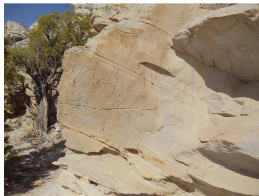
Cedar Canyon petroglyph site.

A large number of human remains have been discovered in this region. Almost all are old, quite decrepit, and battered. They show signs of having had an arduous lifestyle including warfare, as exemplified by Deer Butte Man discussed