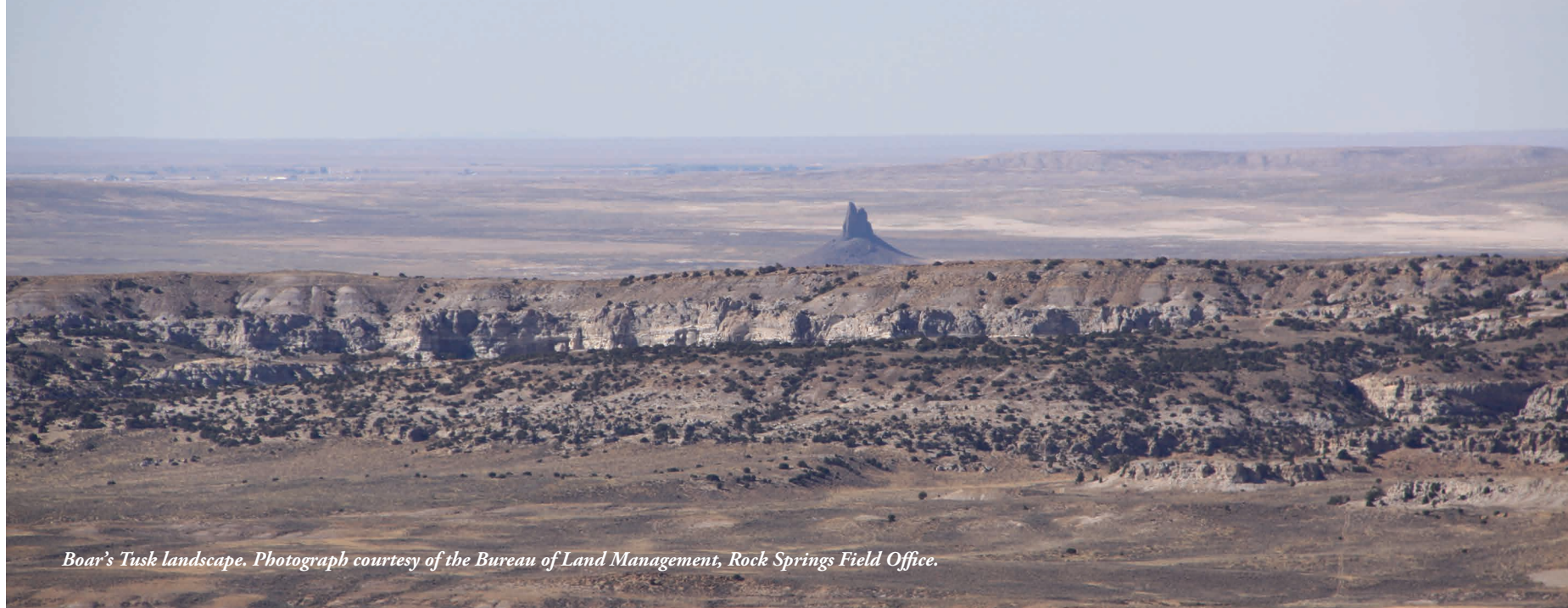
Boar's Tusk landscape.

This landscape has been identified as sacred by Eastern Shoshone, and Uintah and Ouray tribal officials. Consultations with Native American elders indicate that many Vision Questing sites are located within this landscape. Sometimes these sites are marked by stone rings, cairns, or spoke-wheeled alignments of stones set in