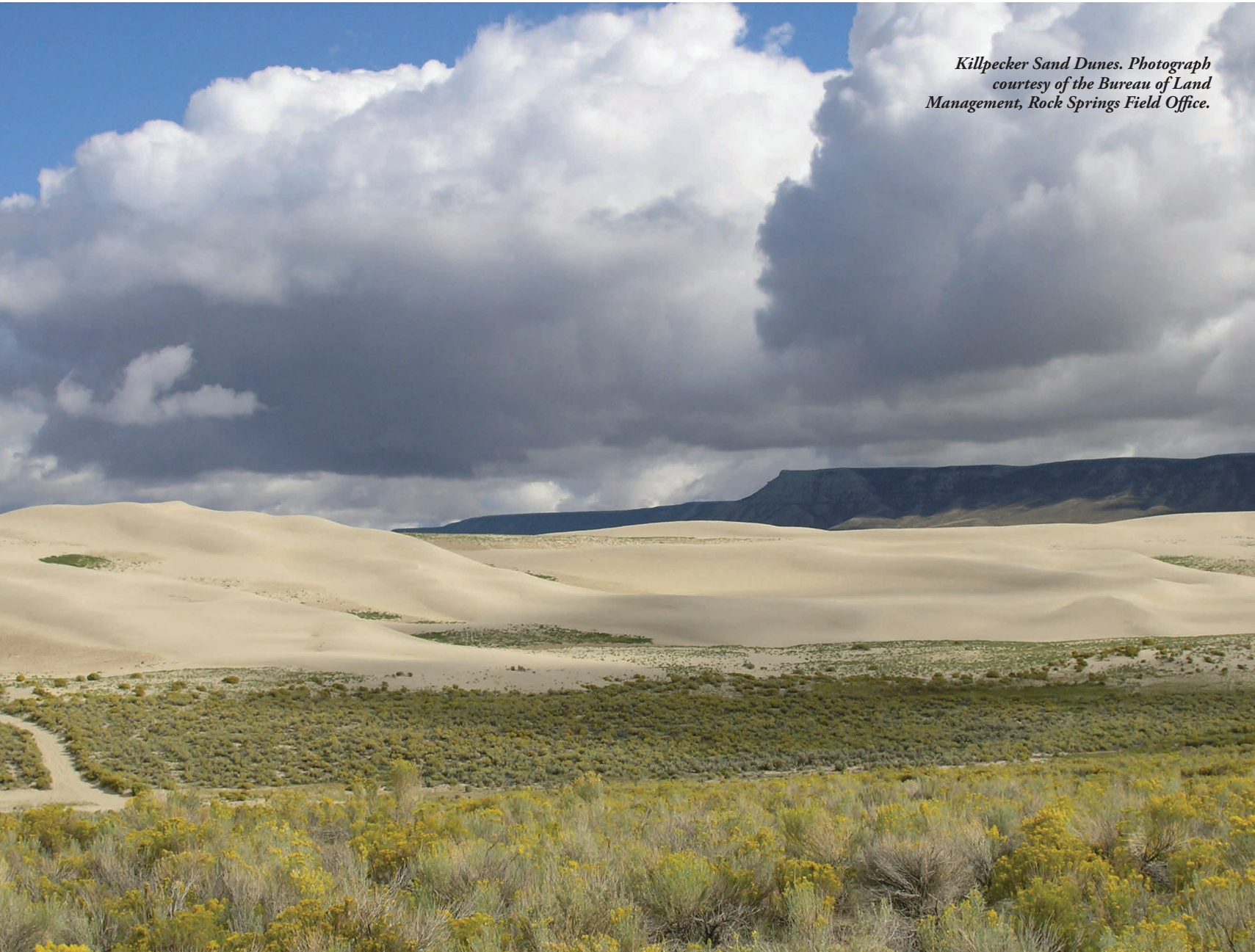
Killpecker Sand Dunes.

The intervening landscapes which link these lands in question are a complex of interrelated and essential places of religious and cultural significance to our people. All of the lands and elements of the environment within the landscape are related.