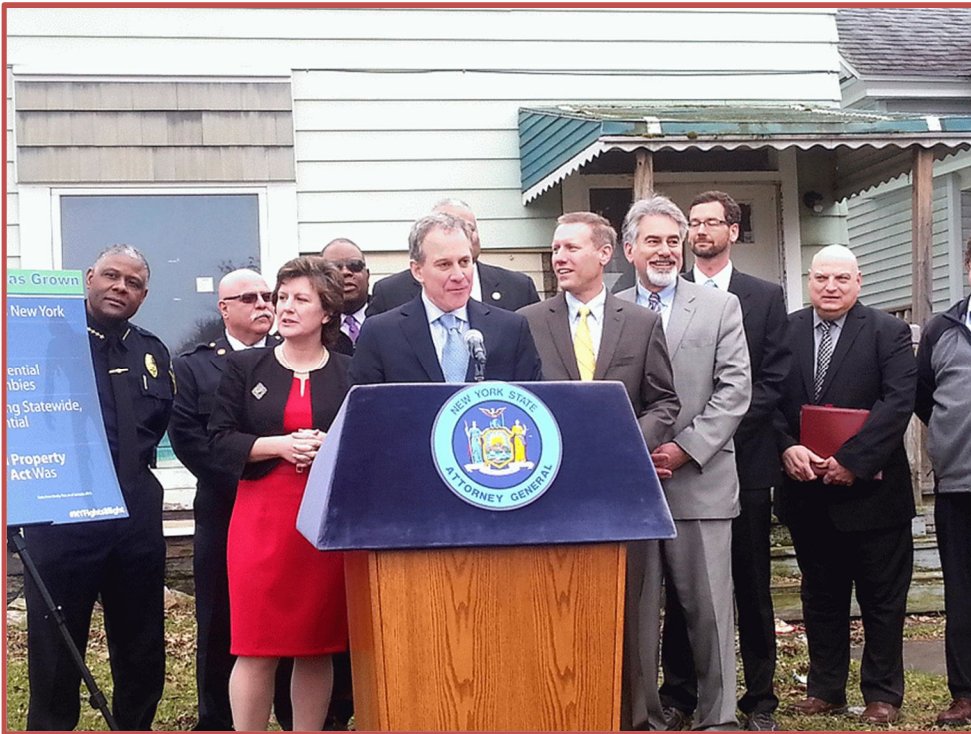
Attorney General Eric Schneiderman and state and local elected officials along with housing, community and law enforcement officials announced the Abandoned Property Neighborhood Relief Act.