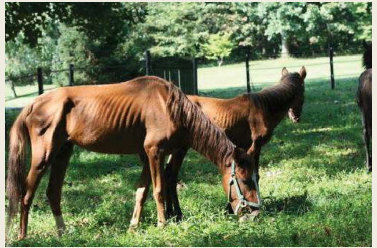
Takoda and Apple when they arrived at FHHR

Liberty gave birth to Freedom a couple months later at our satellite barn. He was adopted immediately by our trainer, who had worked with all five of our mustangs and loved their personalities. He proved to be a fantastic mount and would follow his adopter everywhere while he was training other horses. Because of that, his name was changed to Shadow. Born as a black colt, he grew into an absolutely gorgeous handsome dappled gray gelding. Some of the mustangs have been readopted over the years and their names have also changed. El Dorado is now called Apollo and Takoda is lovingly referred to as Taco. As always, FHHR assisted in these transitions to ensure that these beloved horses remain in loving homes.