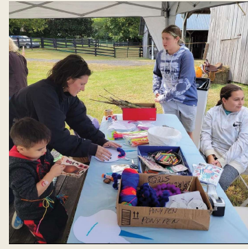
The Spirits & Steeds Market (left) was the largest market we have ever had for this event. The Family Fun Area (right) was a huge success thanks to our volunteers!