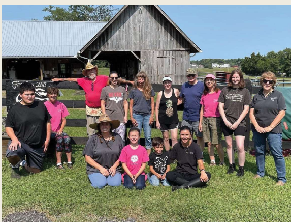
Volunteers at this year's Fall Clean-Up Day, take a break for a group portrait