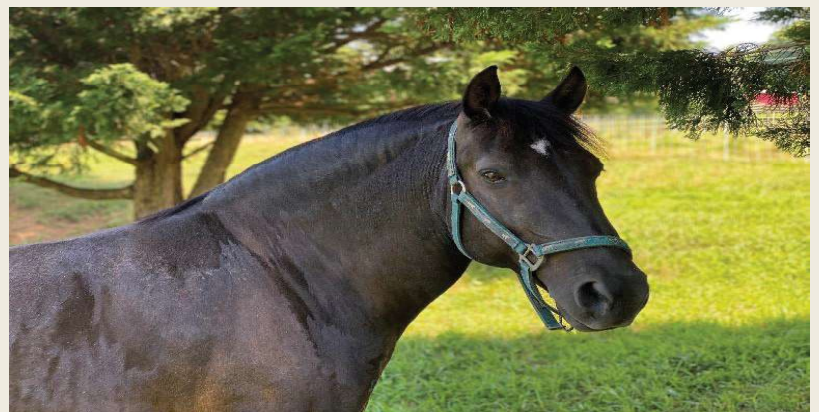
El Dorado, aka Apollo, now