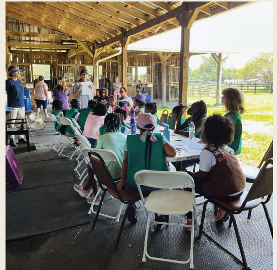
Above: Girl Scouts attend one of our Horsemanship Badge Day programs