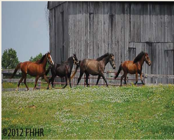
Mustangs at our satellite barn in 2012

In 2009, Freedom Hill Horse Rescue (FHHR) collaborated with Habitat For Horses and many other horse rescues in the U.S.A. to take two Bureau of Land Management (BLM) mustang mares that had been neglected. There were over 220 horses total at Three Strikes Ranch in Nebraska, some already deceased from starvation. Tessa and Cinder were transported to us in 2009 in pretty bad shape. We worked tirelessly to put weight on them, untangle their manes and tails, get their curled up and badly neglected hooves trimmed, dental work done, vet exams and vaccines done and then a few months later, training. Both mares proved to be very smart, wonderful under saddle and they found their adopters by 2011. We recently received updates on both mares and they are doing well. We would like to thank Pam H for travelling to do a check on Cinder who is in VA now and our many thanks to Makayla for her continued contact over the years and updates on Tessa.