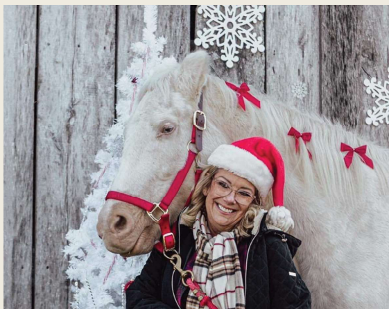
Visitors have their portraits taken with our dressed up horses at Holiday Photos with Horses and Holiday Market