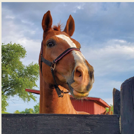
Benne & Itty

Benne is a 24 year old, 16.2hh, Hanoverian chestnut gelding. Benne was dearly loved by his previous owner who passed and he was entrusted to us to be cared for and live out his retirement years. He is trained in level I dressage and has won numerous awards! This sweet boy has Cushings which is managed by medication and will remain a sanctuary horse. Currently in refreshment groundwork training for possible FHHR programs horse in the future.