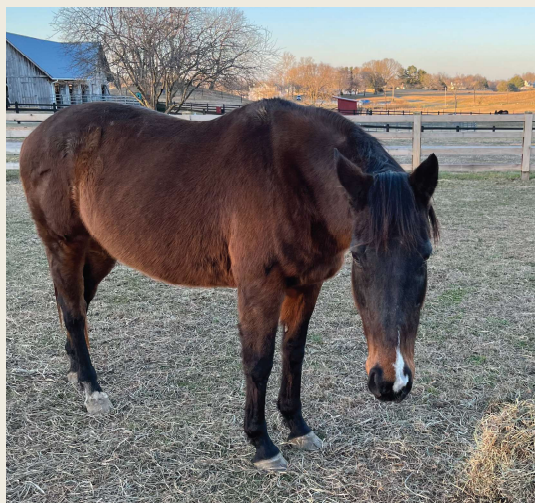
Tuffy (Jewel) & Indy

A beautiful 22 year old, 15hh, OTTB dark bay mare. She is currently in under saddle and groundwork refreshment training. Tuffy, aka Jewel, has a wonderful personality, although a little guarded, she really wants to find her person. She was previously a trail riding horse. She will be available for adoption in the coming months.