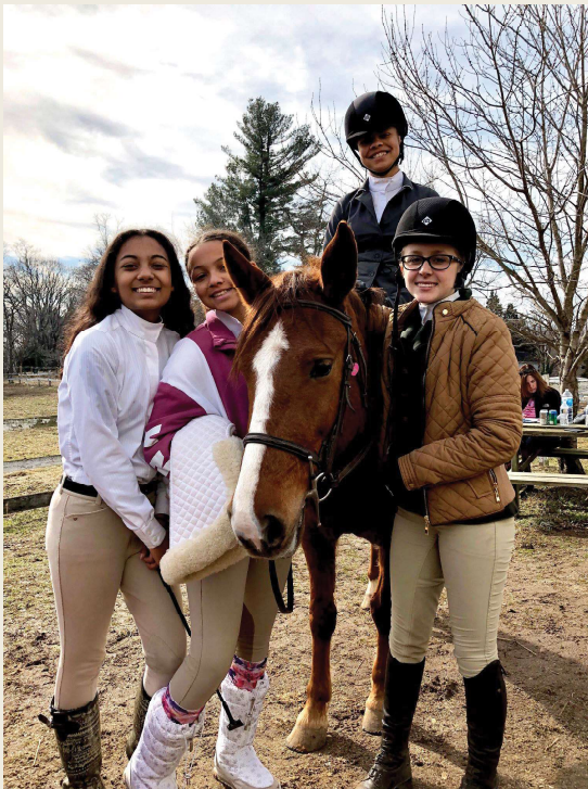
Takoda, aka Taco, with friends