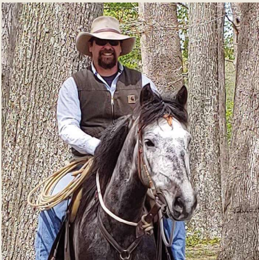
Freedom/Shadow and his adopter today