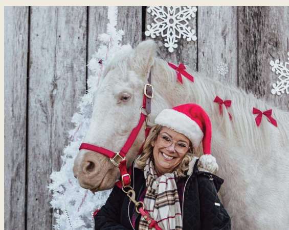
Visitors have their portraits taken with our dressed up horses at Holiday Photos with Horses and Holiday Market