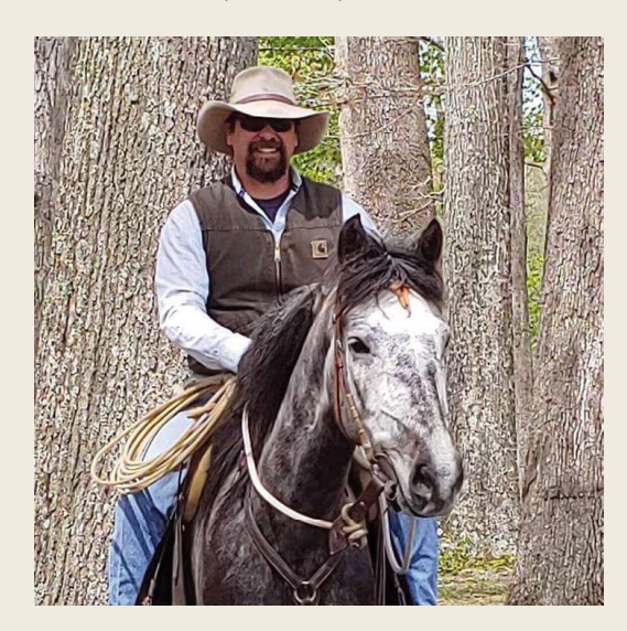
Freedom/Shadow and his adopter today