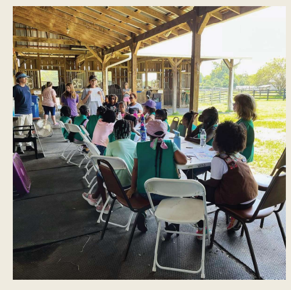
Above: Girl Scouts attend one of our Horsemanship Badge Day programs

Below: Visitors enjoy our Easter Hop program