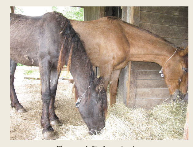
Tessa and Cinder at intake

In 2009, Freedom Hill Horse Rescue (FHHR) collaborated with Habitat For Horses and many other horse rescues in the U.S.A. to take two Bureau of Land Management (BLM) mustang mares that had been neglected. There were over 220 horses total at Three Strikes Ranch in Nebraska, some already deceased from starvation. Tessa and Cinder were transported to us in 2009 in pretty bad shape. We worked tirelessly to put weight on them, untangle their manes and tails, get their curled up and badly neglected hooves trimmed, dental work done, vet exams and vaccines done and then a few months later, training. Both mares proved to be very smart, wonderful under saddle and they found their adopters by 2011. We recently received updates on both mares and they are doing well. We would like to thank Pam H for travelling to do a check on Cinder who is in VA now and our many thanks to Makayla for her continued contact over the years and updates on Tessa.