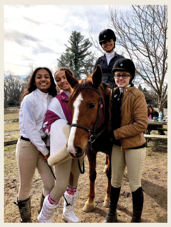
Takoda, aka Taco, with friends

Liberty gave birth to Freedom a couple months later at our satellite barn. He was adopted immediately by our trainer, who had worked with all five of our mustangs and loved their personalities. He proved to be a fantastic mount and would follow his adopter everywhere while he was training other horses. Because of that, his name was changed to Shadow. Born as a black colt, he grew into an absolutely gorgeous handsome dappled gray gelding. Some of the mustangs have been readopted over the years and their names have also changed. El Dorado is now called Apollo and Takoda is lovingly referred to as Taco. As always, FHHR assisted in these transitions to ensure that these beloved horses remain in loving homes.