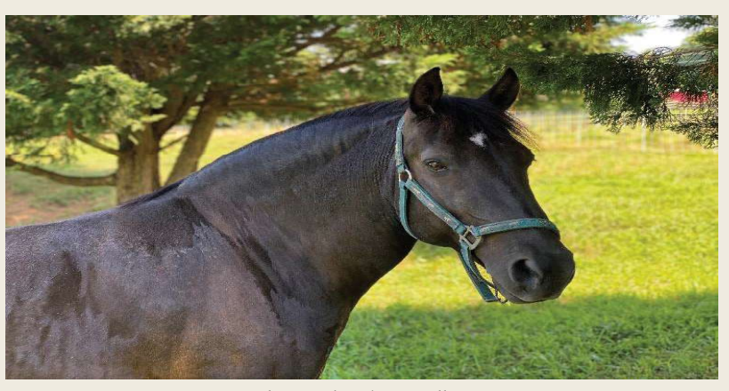
El Dorado, aka Apollo, now