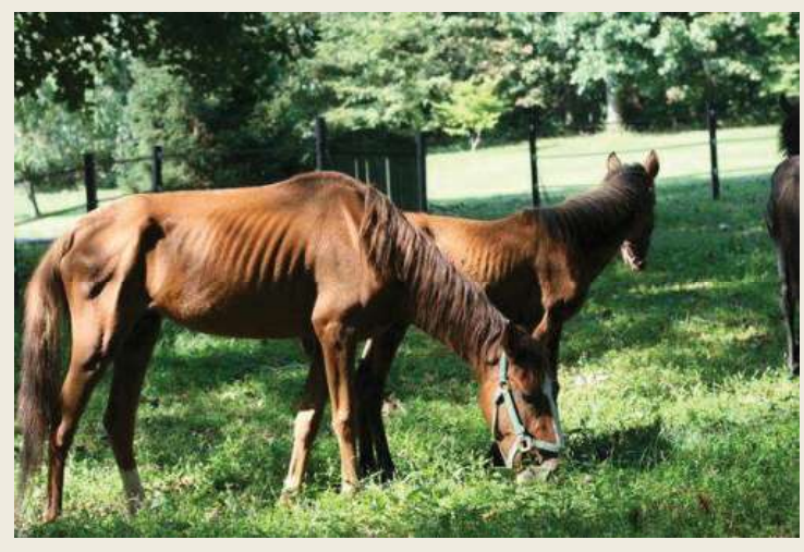
Takoda and Apple when they arrived at FHHR