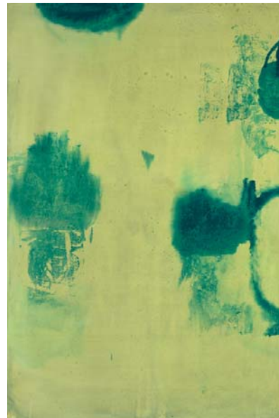
Rock Valley 3 , 2014; acrylic on canvas, 48 x 72 in.

New York, NY (September 29, 2015) Hionas Gallery is pleased to announce its upcoming two-person show of new works by sculptor Alain Kirili and painter Bobbie Oliver . Comprising Kirili's open form, calligraphic pieces made from forged raw iron, and a selection of new acrylic, abstract canvases by Oliver, the exhibition joins two bodies of work that, though starkly different in medium, are unlikely kin in terms of process. From inception to completion, Kirili and Oliver yield some measure of control to their respective elements, allowing nature to take its course and dictate the fluid and gestural state of each piece.