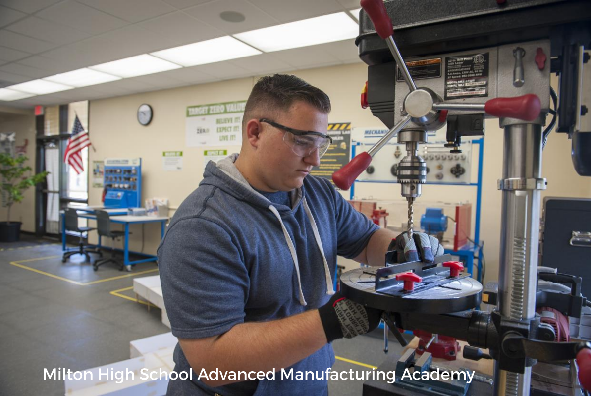
Milton High School Advanced Manufacturing Academy