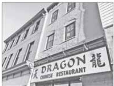
The renovation of Dragon Chinese Restaurant was the fifth facade project undertaken by the Downtown Hazleton Alliance for Progress.

Contact the writer: jdn@standardnews.com; 570-501-3585