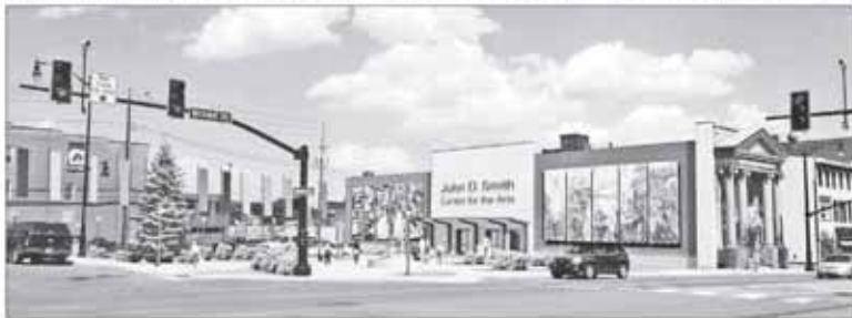
Eastbound motorists on Broad Street will see this view of the new city arts center now under construction in the former Security Savings building in downtown Hazleton. The artist's sketch was included in a booklet for the Banking on the Arts capital campaign.

"A visual arts center was created there because there