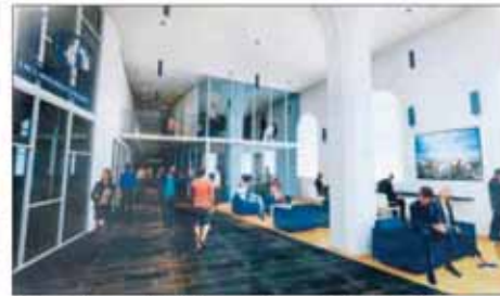
Artist's sketches show what the Hazleton Arts Center, left, and Lackawanna College's new Hazleton center might look like.